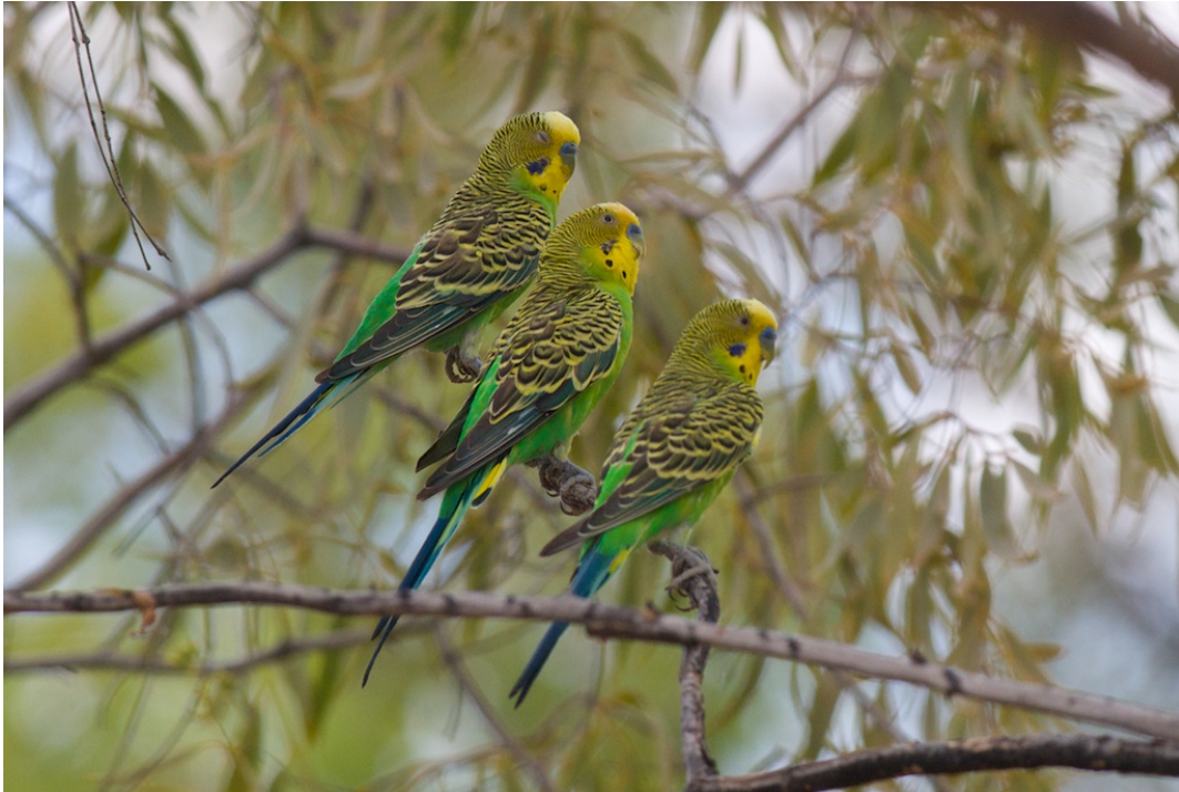
The specialty bird we'll seek is the Budgerigar (Melopsittacus undulatus).

This 3 night/4 day tour starts and ends in Mt Isa. The prime purpose of the tour is to see the budgerigars which visit the town, often in large numbers, during the dry spring months when the only water available is in the town dams and cattle troughs.