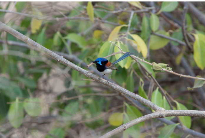
Purple-backed Fairywren (Malurus lamberti).