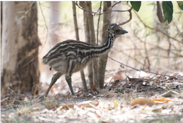
Emu Chick (Dromaius novaehollandiae).

Please note that depending on flight schedules you may need to overnight in Mt Isa.