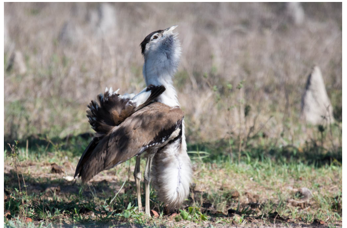
Australian Bustard (Ardeotis australis).