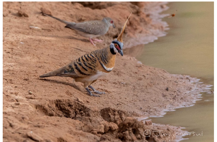
Spinifex Pigeon (Geophaps plumifera).