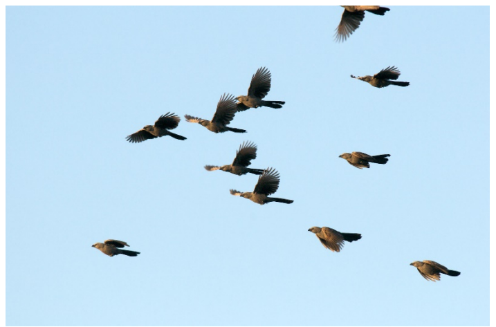
Apostlebird (Struthidea cinerea).