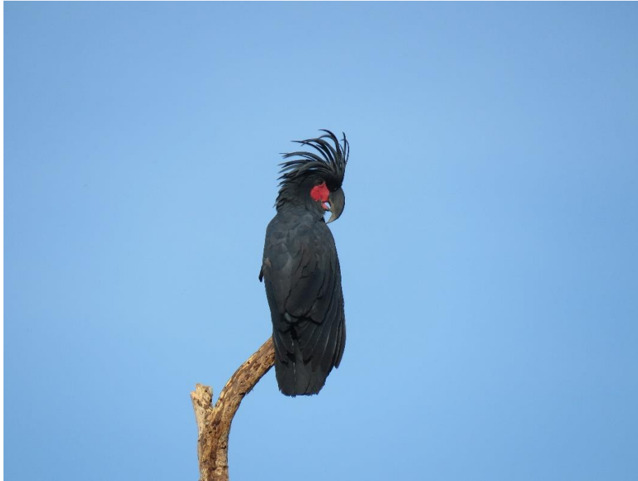
Palm Cockatoo ( Probosciger aterrimus )