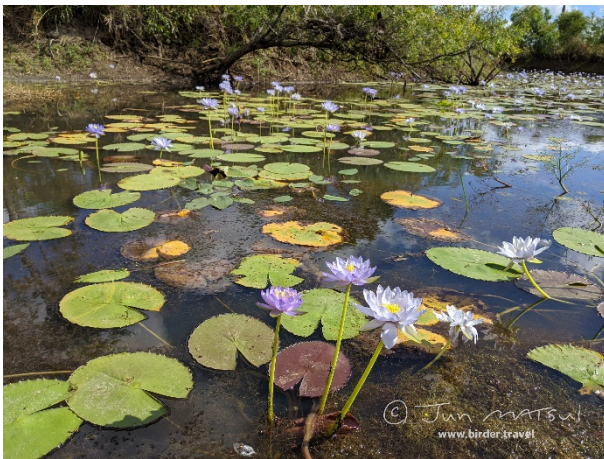
Billabong @ Lotusbird