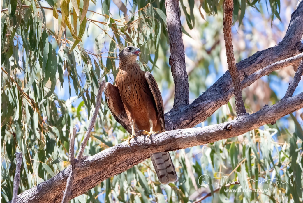
Red Goshawk ( Erythrotriorchis radiatus )

We headed back to Cairns by a different route, driving through Rinyirru NP. We stopped at several locations in the park to stretch our legs, take photographs and look at birds. We arrived in Lakeland in time for lunch. From here we headed back to Cairns.