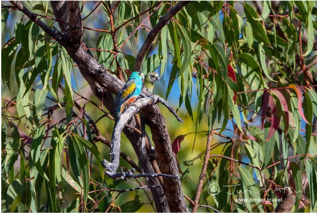
Golden-shouldered Parrot ( Psephotus chrysopterygius )