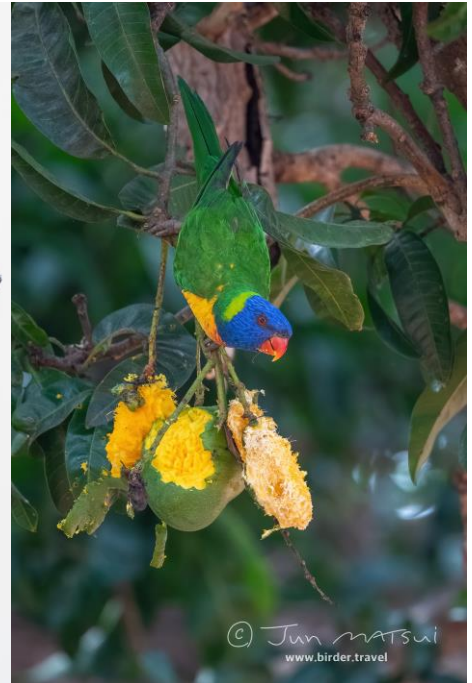
Rainbow Lorikeet © Jun