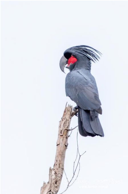
Palm Cockatoo © Jun

Day.7: We started birding near the 3-ways. Then we went back to the sewage pond, Quintel Beach and the Boat Ramp before returning to the airfield for Detlef and Elizabeth's flight back to Cairns.