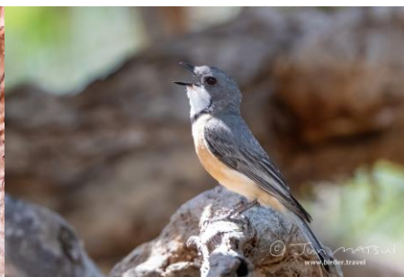
Rufous Whistler