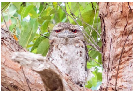
Papuan Frogmouth