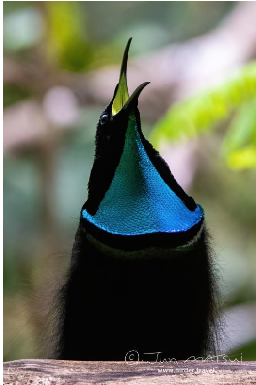
Magnificent Riflebird ( Ptiloris magnificentus )