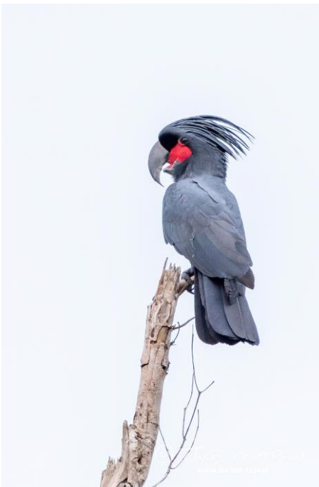
Palm Cockatoo